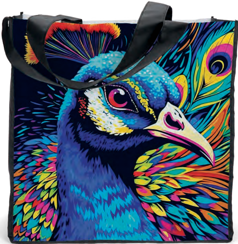
PICASSO TOTE Pages 32-33

Tap into high-impact print capabilities to make your artwork jump off the bag, including multi-dimensional effects, iridescent finishes, and bright colors.